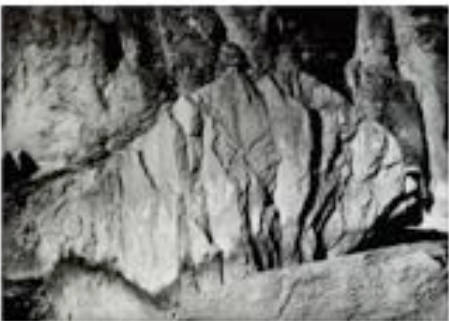
Shoshone Falls: High Noon, Boulder with Wave Water Mark, Along the Snake River (Thinking About Hokusai), Pillar Falls Canyon, Jerome County, Idaho, USA, 2003-2004