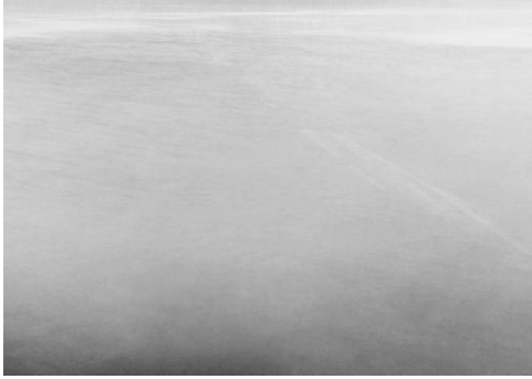
The mouth of the York River, At Chesapeake Bay, The Yorktown Battle Site, York County, Virginia, U.S.A., 2009/2014

The site of General George Washington's defeat of the English General Earl Cornwallis and the victory that won the Revolutionary War for America, 1781.