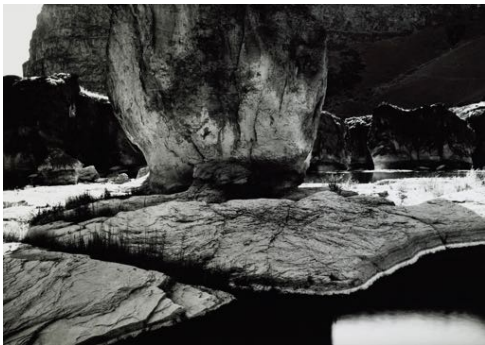
Shoshone Falls: Pillar Rock and The Snake River, Pillar Falls Canyon, Twin Falls County, Idaho, USA, 2003-2004