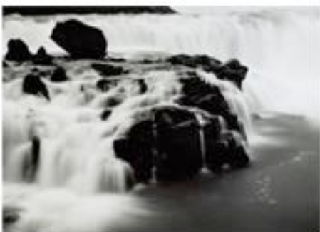
Shoshone Falls: Mythic Stone, A Premonitional Work, message to Timothy H. O'Sullivan, Gullfoss (Golden Falls), Iceland, 1987