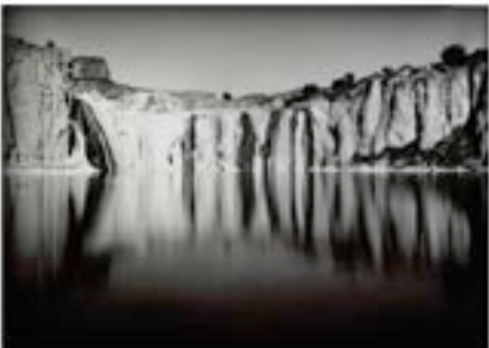
Shoshone Falls: High Noon, Shoshone Falls, From the Floor of the Snake River Basin, The Jerome and Twin Falls County Borderline, Idaho, USA, 2003-2004