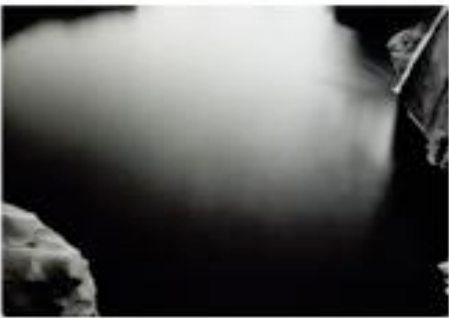
Shoshone Falls: Lingering Twighling, The First View, Shoshone Falls, Centre Rim Top, The Snake River Basin, The Twin Falls and The Jerome County Borderline, Idaho, USA, 2003-2004,