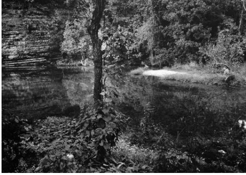
Remembering My Father's Tribal Grandparents, On the Little Blue, Southwest of the Unita Homestead, The Cherokee Nation, Maries County, Oklahoma, U.S.A., 2003/2004