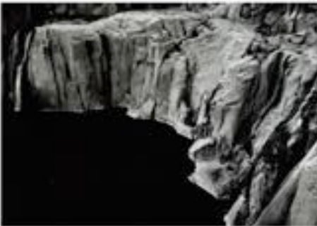
Shoshone Falls: Shoshone Falls and The Snake River Basin, The East Bank Rim Top, Jerome County, Idaho, USA, 2003-2004