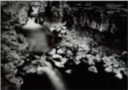
Shoshone Falls: The Snake River, Cauldron Linn, No. 2, Jerome County, Idaho, USA, 2003-2004