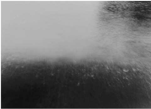
The James River and The Thorofare Black Point, Jamestowne Island, James City County Virginia, U.S.A.