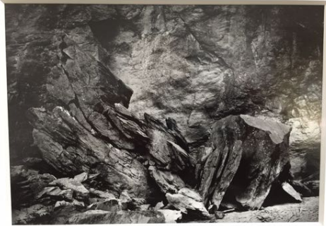
Shoshone Falls: Broken Boulder, Pillar Falls Canyon, Jerome County, Idaho, USA, 2003-2004,