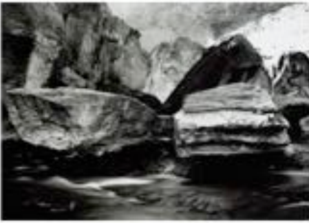
Shoshone Falls: The Snake River, Pillar Falls Canyon, Twin Falls County, Idaho, USA, 2003-2004