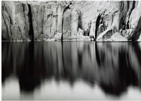
Shoshone Falls: Early Morning, Shoshone Falls, From the Floor of the Snake River Basin, The Jerome and Twin Falls County Borderline, Idaho, USA, 2003-2004