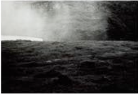
Shoshone Falls: A Premonitional Work, message to Timothy H. O'Sullivan, Gullfoss (Golden Falls), Iceland, 1987, Part 1 of a 2-part work