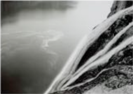
Shoshone Falls: "Bridal Falls", Shoshone Falls, The Snake River Basin, The West Bank Rim Top, Jerome County, Idaho, USA, 2003-2004, Part 1 of a 2 part work