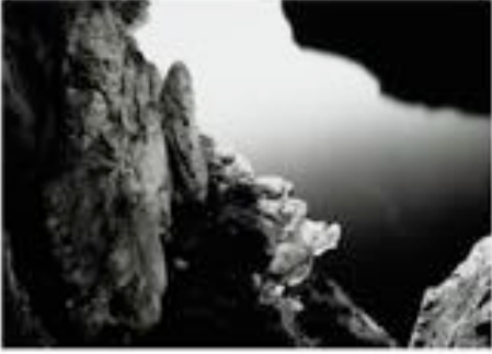
Shoshone Falls: Riolite Rocks, Shoshone Falls, The Snake River Basin, The East Bank Rim Top, Twin Falls County, Idaho, USA, 2003-2004