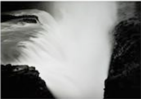
Shoshone Falls: A Premonitional Work, message to Timothy H. O'Sullivan, Gullfoss (Golden Falls), Iceland, 1987, Part 2 of a 2-part work