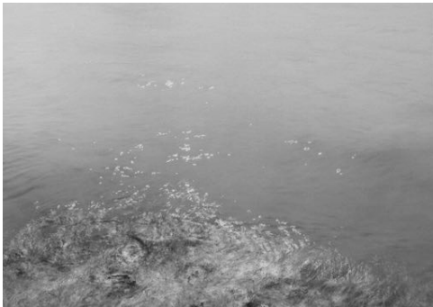
A Beacon for Beacon, High Noon on The Hudson River, Beacon Landing, Beacon, Dutchess County, New York, USA, 2000-2003