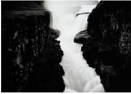
Shoshone Falls: A Premonitional Work, Gullfoss (Golden Falls), Iceland, 1987