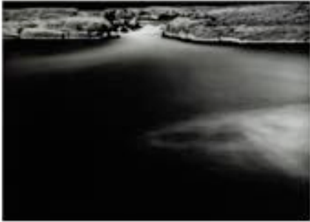
Shoshone Falls: The Snake River, "The Funnel", No.1, Piller Falls Canyon, Twin Falls County, Idaho, USA, 2003-2004