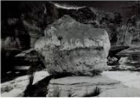
Shoshone Falls: High Noon, Binding Light and Heat, Boulder and The Snake River, Pillar Falls Canyon, Twin Falls County, Idaho, USA, 2003-2004