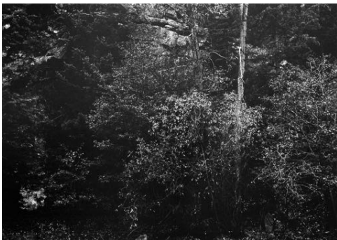
Last Light, Autumn, Along the Pecos River, The Pecos National Wilderness Area, Near Windy Bridge, San Miguel County, 2003-2004