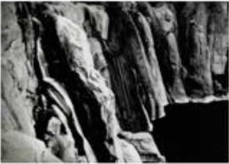
Shoshone Falls: Shoshone Falls and The Snake River Basin, The West Bank Rim Top, Jerome County, Idaho, USA, 2003-2004