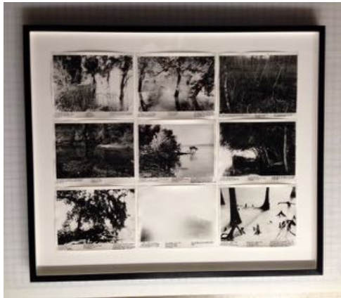
Proofs with Notes for the Series: Drowned Trees along the Mississippi, From source to sea Continuing observations on an American history of place