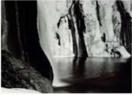
Shoshone Falls: "Bridal Falls", Shoshone Falls, The Snake River Basin, The West Bank Floor, Jerome County, Idaho, USA, 2003-2004, Part 2 of a 2 part work