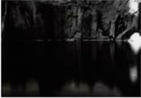
Shoshone Falls: Early Evening, Shoshone Falls, From the Floor of the Snake River Basin, The Jerome and Twin Falls County Borderline, Idaho, USA, 2003-2004