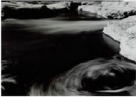
Shoshone Falls: The Snake River, "The Fullel", No. 3, Pillar Falls, Twin Falls County, Idaho, USA, 2003-2004