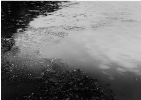
The Potomac River - looking down river Mount Vernon, Fairfax County, Virginia, USA 2009/2014

Looking towards the arterial edge of America – east-southeast from George Washington’s home (1754-1799), on the Potomac River.