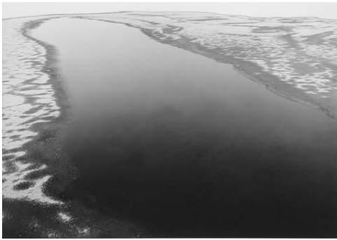
The Great River, Snow Storm-Life Line, Rio Grande River Crossings, The Source of the Rio Grande, Mineral County, Colorado, USA, 1995